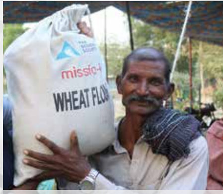
PROVISION OF FOOD ITEMS