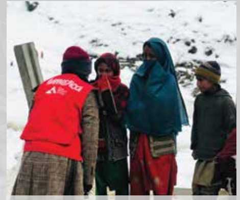
OUR REACH IN HARD-TO-REACH AREAS