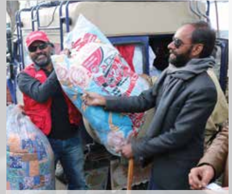
PROVISION OF WINTERISED KITS