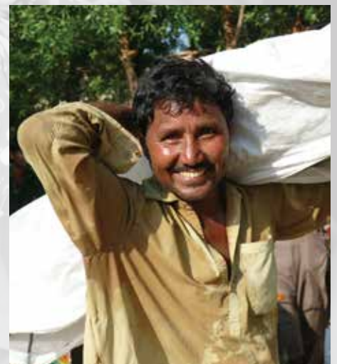
PROVISION OF SHELTER MATERIAL