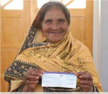
PROVISION OF MULTIPURPOSE CASH GRANTS