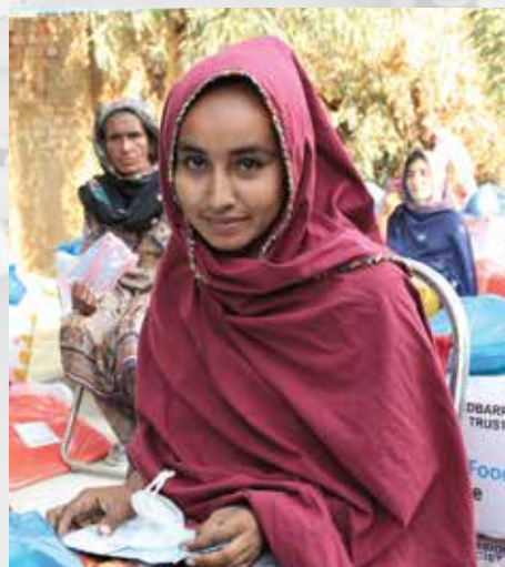
PROVISION OF DIGNITY KITS