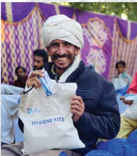
PROVISION OF HYGIENE KITS