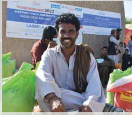
PROVISION OF AGRI INPUTS